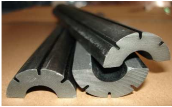
TREADING CHASERS HEADS + CHASERS